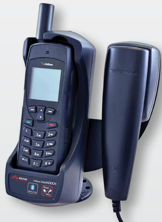
IntelliDOCK 9555 with optional Privacy Handset