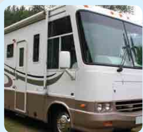
Motor Homes / Recreational Vehicles