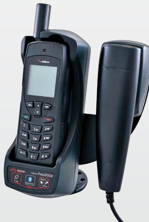
PotsDOCK 9555 with optional Privacy Handset