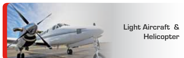
Light Aircraft & Helicopter